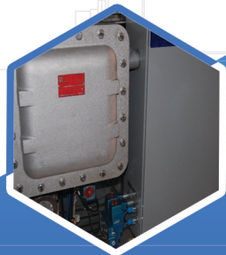
PW-6 through 12 Stainless Steel Version